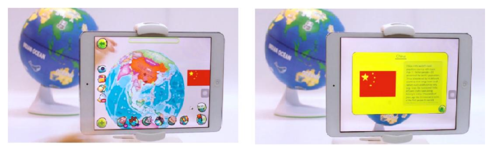
Fig2: Country Introduction