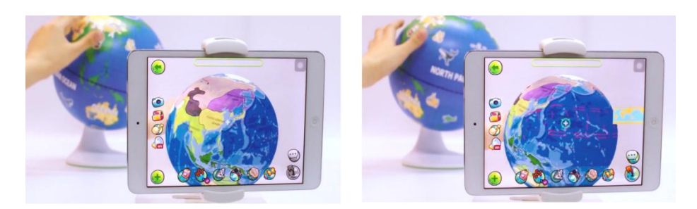
Fig4: Ocean Gyre