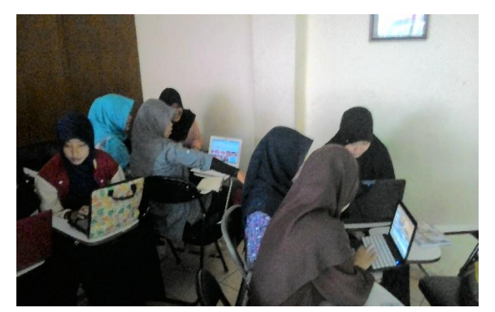
Figure 4. Students Discussing the Dialogue-Making Using Plotagon

The results revealed that the students gave positive responses to this learning activity. They realized that there were many inputs obtained from this writing course. Through PBL, they acquired additional skills, such as improving aesthetics, creating content using digital tools, and practicing the interaction process with multimodal media. Following are the excerpts of the interviews: