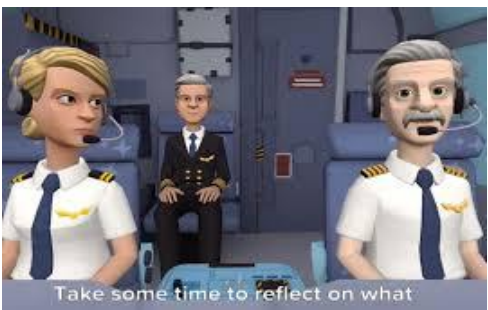
Figure 1. Character Creation in the Plotagon

This software can become an ideal media for developing PBL in narrative writing. The teachers can allow the students to explore technological tools, and guide them through these technological tools played in learning activities (Mishra and Kohler, 2006). Therefore, the process of learning is presented in a fun way, so that it can increase students' motivation, especially in learning to write.