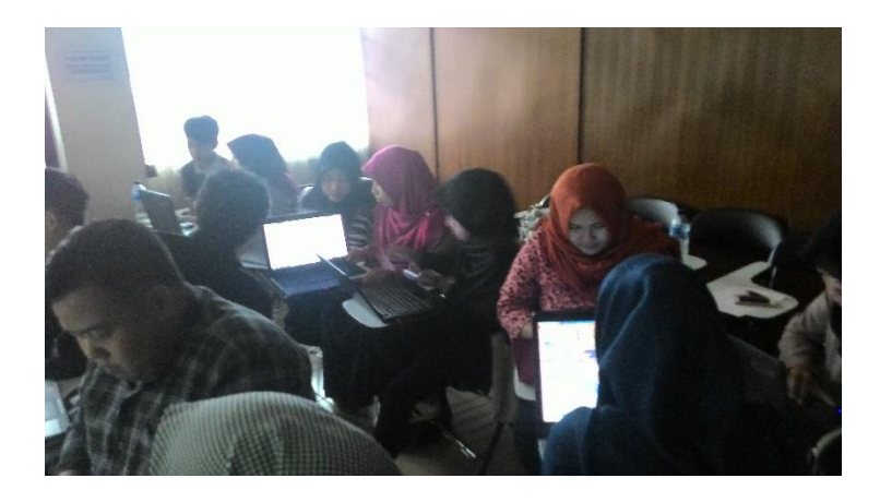
Figure 2. Students' Enthusiasm during Discussions

The observation data showed that convenience in the learning process made them be able to exert the best potential. The students were enthusiastic about participating in the learning session. On the other hand, they also obtained an interesting assignment in accordance with their world. This factor was important in supporting learning success, besides increasing learning motivation. With fun and humanistic assignment, of course, the students would be interested in participating actively in the learning process, between in-class discussions, activities outside the classroom, and participation in project work.