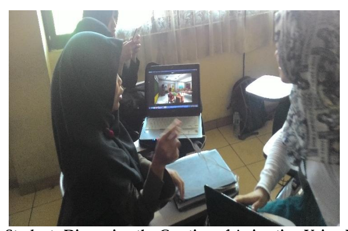
Figure 3. Students Discussing the Creation of Animation Using Plotagon

By implementing PBL in learning writing, the lecturer had the opportunity to provide varied assignments that would help students understand the learning material. In relation to students' animation project, the variety of assignments given by the lecturer include discussion, collaborative writing, editing, evaluations with peer students, and product publication and presentation. These also could be found in the data obtained from the observations. The variety of activities and assignments were designed so that students obtained a form of assignment that was authentic and close to the daily context. In addition, the students were able to use language skills in the real context. They also got the opportunity to acquire useful skills in the language.