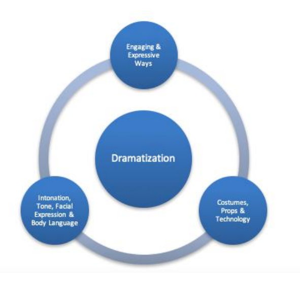
Figure 1. Ways of Telling/Reading Stories for Moral Education