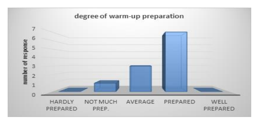
Figure 2: Teachers' preparation of warm-up in rehearsal

In <figure 2>, seven teachers believe that warm-up is necessary as early mentioned. And here none of them is hardly prepared nor very well prepared in terms of warm-up rehearsal. Out of them, only seven teachers answer that they tend to develop for warm-up contents and its orders.