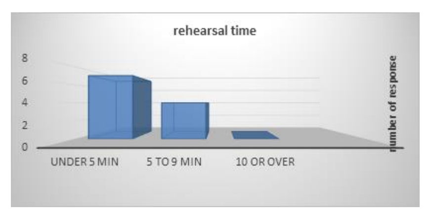
Figure 4: The amount of time for warm-up

four teachers see that their students are 'positive reaction' toward the warm-up time. It seems that the students who have experienced their teachers' warm-up technique tend to be reluctant to join in the warm-up process.