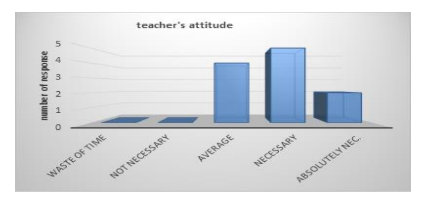
Figure 1: Teachers' attitude toward the importance of warm-up in rehearsal

Teachers' mind-set toward warm-up practice in choral rehearsal is shown as the below <figure 1>. It shows that teachers believe warm-up is not a waste of time but a necessary process in the choral rehearsal. Seven teachers respond that warm-up is necessary or absolute procedure for chorus preparation.