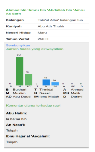
Figure 3. Display of the Narrator's Information

After analyzing sanad and rawi , the participants were instructed to analyze the narrators of the hadith and explore information about the assessment of the narrators according to ulama jarh wa ta'dil . By clicking on number 3 as shown in the Figure 1, the biography of the narrator is presented, the number of hadith narrated and in any book, as well as the assessment of the ulama jarh wa ta'dil about the narrator. For example, in the hadith there was a narrator named Ahmad bin Amru bin Abdullah bin Amru as-Sarh. Then the information obtained from the narrator in the EHK9I application is shown in Figure 3.