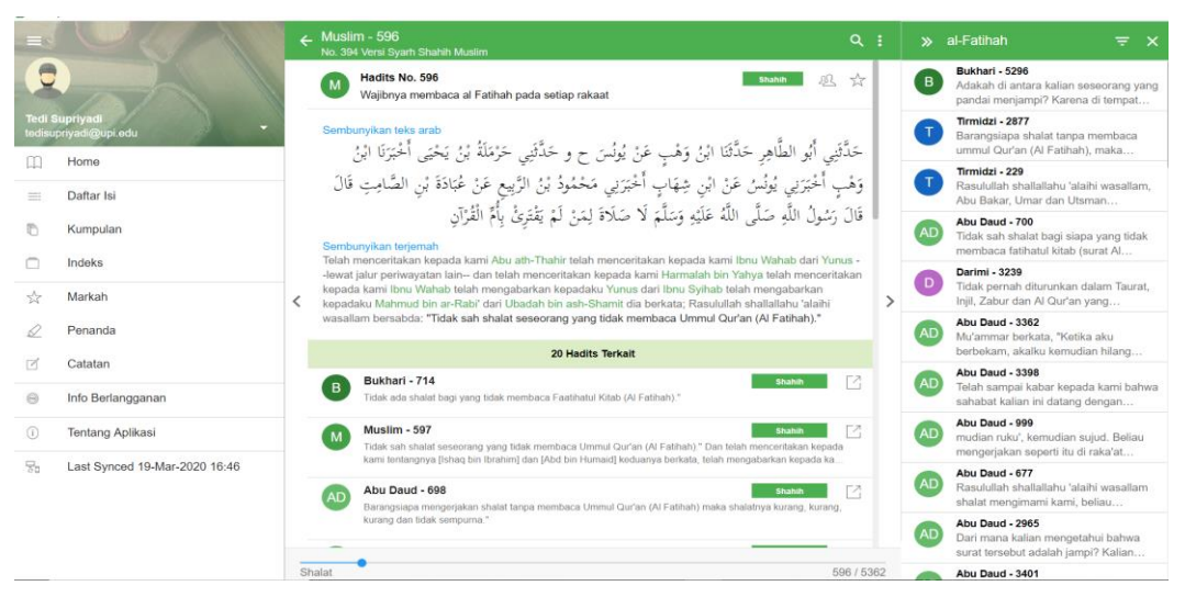
Figure 2. Display of Hadith related to Surah Al-Fatihah in the EHK9I Application

After entering the keywords, the display will appear as shown in Figure 2.