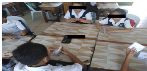
Figure 2: Teacher introduced 20 targeted vocabularies using flash cards and word cards.