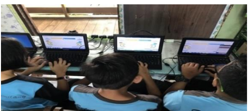
Figure 9: Pear Deck was used as an enrichment to help the respondents to retain the vocabularies learned.