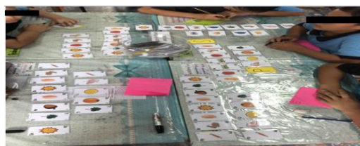
Figure 3: Each respondent was given 13 cards at random.