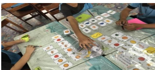
Figure 5: Respondents read, spelled and explained the meaning of the word to obtain marks.