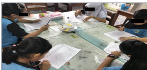
Figure 1: Pre-test was conducted before the intervention.