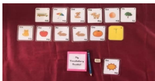
Figure 7: All the vocabularies formed were jotted down in the vocabulary booklet.