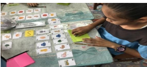
Figure 6: Respondents added up their marks on the top right corner of the card.