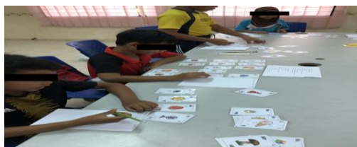
Figure 4: Respondents formed at least four letters of words that they have learned.