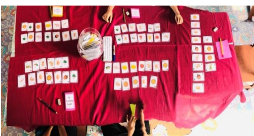
Figure 8: The game ended when one respondent had placed all of his cards. Respondent with highest score won.