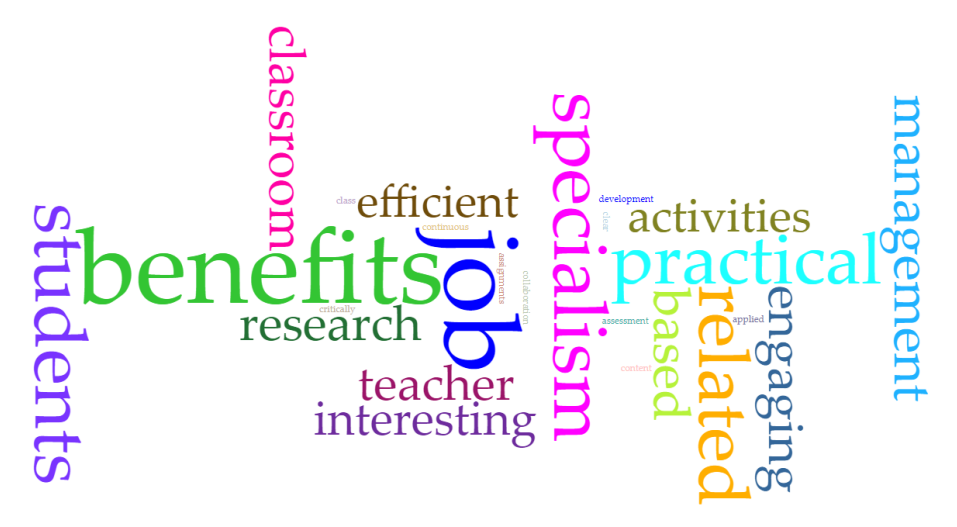
Figure 3: Distribution of the mostly used words in teachers' observation reports

The analysis of the correlation of terms is presented in Table 5.