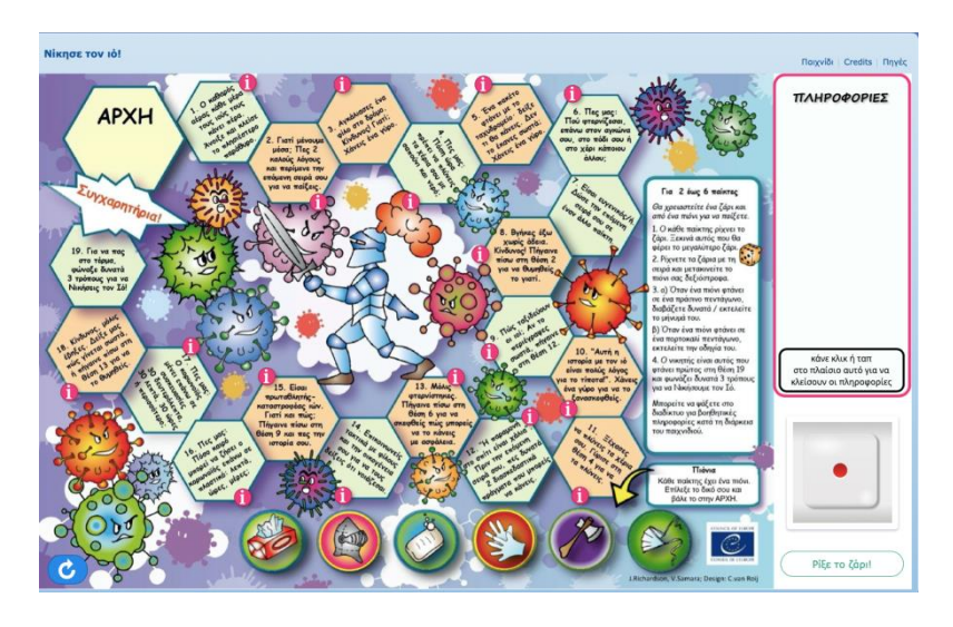
Figure 5: Defeat the Virus Screenshot

The Council of Europe's "Defeat the Virus" game (Figure 5), developed during a pandemic, was critical in helping children understand the virus in a simple and enjoyable way, which we found to be extremely useful.