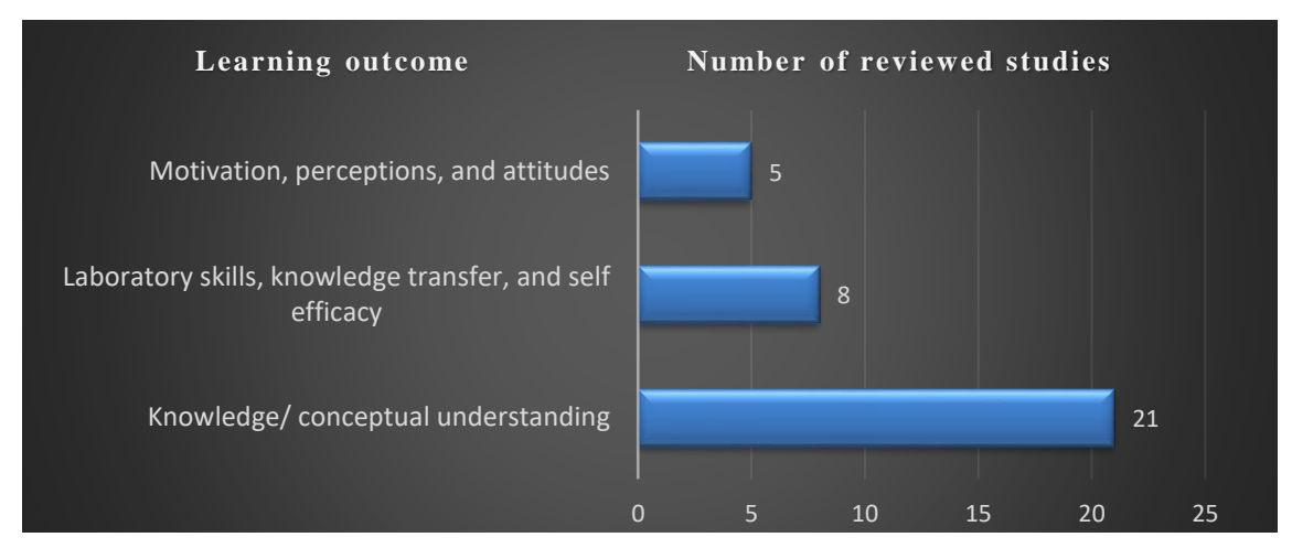
Figure 3: Learning outcomes identified in the reviewed studies

The learning outcomes identified in the reviewed studies were grouped into three categories (Figure 3). These are: 1) knowledge and conceptual understanding; 2) laboratory skills, knowledge transfer, and self-efficacy in laboratory activities; and 3) students' motivation, perceptions, and attitudes towards biology and the learning environment. Some of the reviewed studies assessed more than one of the above learning outcomes. The total number of studies indicated in Figure 3 therefore exceed the number of reviewed studies. The overall findings indicated that the learning outcomes varied, but in most studies, knowledge and conceptual understanding were frequently assessed.