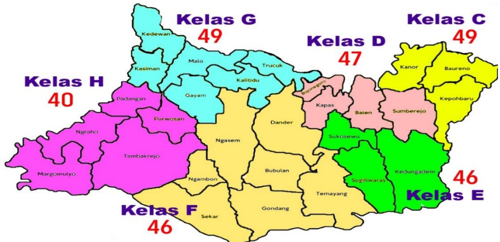
Figure 3: Map of class distribution of Recognition of Past Learning in the Village of Public Administration Science Study Program

students to work together and discuss the lectures. Figure 3 depicts the class distribution map for the Village Past Learning and Recognition Program, an undergraduate program in public administration.