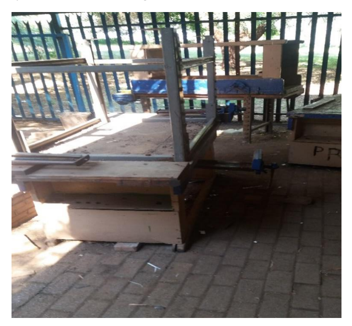
Figure 2: Teacher A's outside workshop

Teacher A's note that learners were no longer interested in woodwork was verified by the workbenches that were left outside, thereby showing that they do not use them any more, (Refer to Figure 2 below):