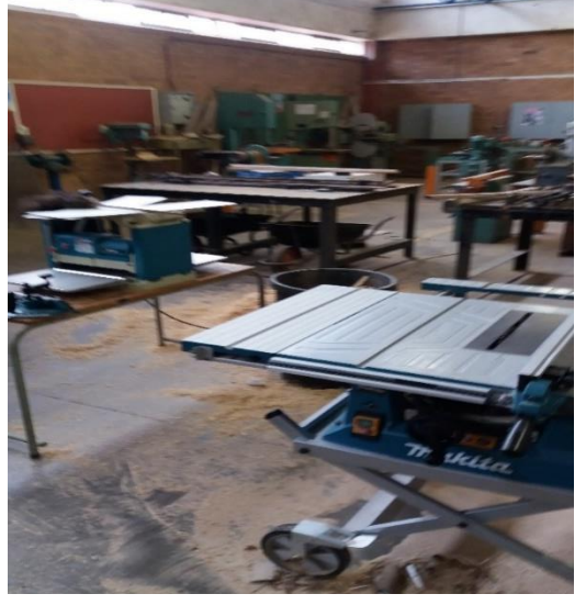
Figure 3: Teacher F's workshop

With regards to the physical layout of Teacher F, there was evidence to prove that the workshop was functional; since there was also sawdust in the workshop, showing that learners had used it before .(See Figure 3 below}: