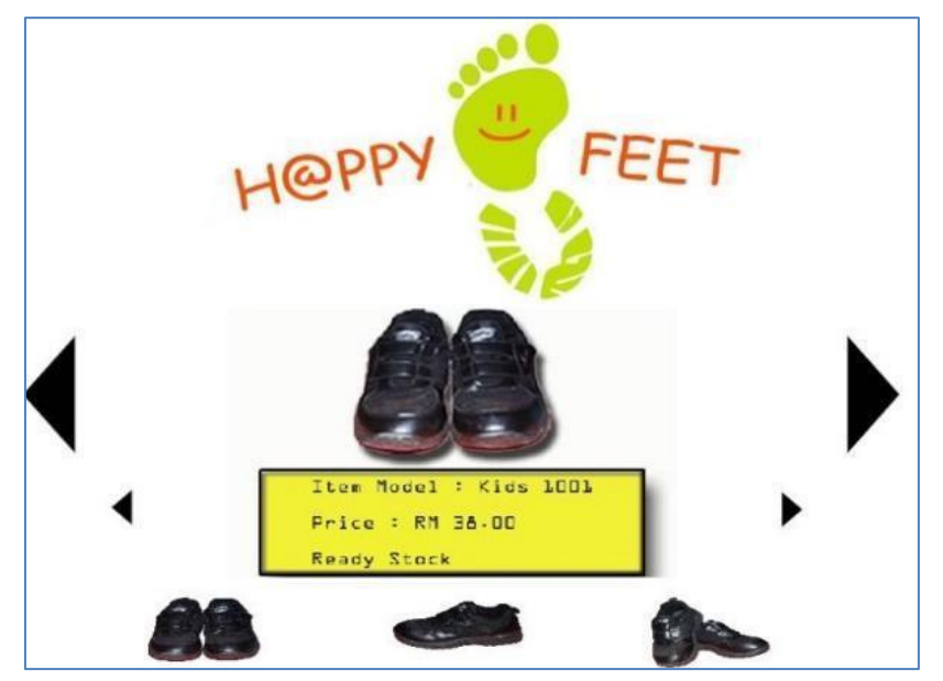
Figure 2: Student team's final project outcome

A multimedia group project was assigned to all groups, and the project required students to work collaboratively in solving the problem. Students were tasked to rebrand the existing advertisement content, which had an unattractive and outdated design, within 14 weeks. Figure 2 shows an example of a student's project outcomes, and Figure 3 illustrates their online collaborations.