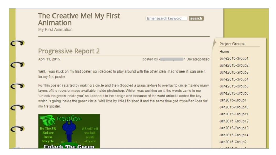
Figure 3: Student online collaboration with web tools