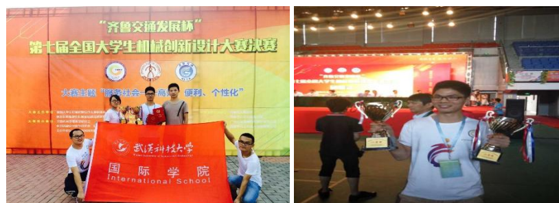
Figure 3 Gold Award in the “seventh National Innovation Design Competition”