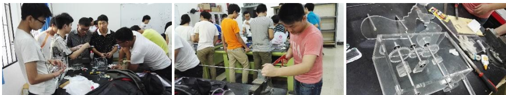
Figure 2 The product design and manufacturing process

Students are asked in almost all courses to make (in teams of 4 or more students) mini projects that they have to present in class. This mini project presentations had a tremendous effect on their skill of communication as well as team work (in addition to the knowledge acquired during the project work), as shown in Figure 2. In addition, one of the team attended the “seventh National Innovation Design Competition”, and obtained a Gold Award, as shown in Figure 3. Bachelor senior project is also performed in multidisciplinary teams (from all minors), the aim being to encourage students to work with people, having different skill, helping each other’s. Finally, a rate of success increases by 50% was noticed as compared to other similar curriculum in our university.