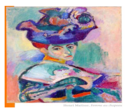
Figure 2. A Representation of French Paintings

In addition to painting, France is also famous for other arts such as film, music, literature, poetry, and Theatre. Some French films that have been shown worldwide are referenced in Alter Ego Plus Niveau B1 book, such as untouchable, La Môme, and so on. With regards to music, French people have a tradition of making musical literature with poetic nuances, satire or drama. This musical literature was developed between 1950 and 1960. Some famous musical figures rose to prominence in this era, such as Édith Piaf, Charles Trenet, Georges Brassens, Barbara, and so on. After this era was over, three new trends emerged in French music: Les chansons faciles(light songs), which was popularized by Claude François, Dalida, and Jonny Hallday; then Les chansons engagées (political/protest songs), which was popularized by Jacques Higelin, Bernard Lavilliers, and Alain Bashung; and finally Les chansons de tradition régionale (folk songs). This type of song was popularized by Thomas Fersen dan Nolwenn.