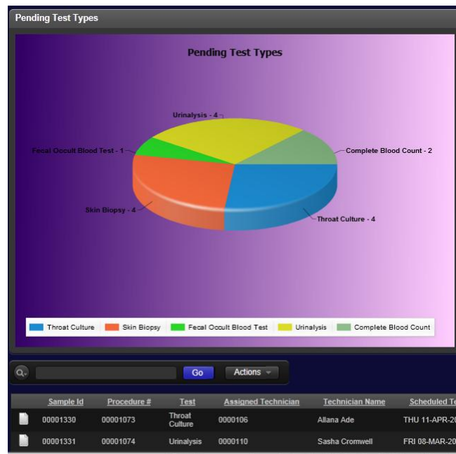
Figure 2: A Report Generated by a student in CW3

Students are appreciative of overall course delivery mechanism, theoretical content and the hands-on-training aspects. Students felt that they had the freedom in solving the course work which is essentially take home type. The strategy of having one problem to each student paid rich dividends. When students completed the first coursework, they felt the experience of completing one complete database design and implementation cycle involving use of various IT tools. Students liked the principles of PBL approach, as they do not have to research much on the problem itself and can focus on providing a database solution to the problem.