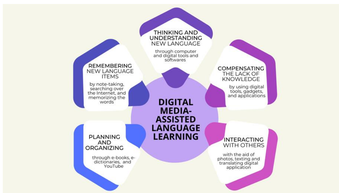
Figure 1: Digital Media-Assisted Language Learning (DMALL) Paradigm

In the condition of selected international students, their language learning can be categorized under the Oxford, O'Malley, and Rubin taxonomies since the result described different strategies in planning and organizing, remembering, thinking and understanding, compensating and interacting. However, the result showed that integrating digital media such as the internet, cellphone, and computer applications is valuable and helpful in the participants' language learning. Thus, the researcher developed the digital media-assisted language learning (DMALL) paradigm (see Figure 1) since it best describes the participants' strategy.