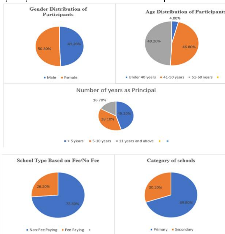
Figure 1: Socio-demographic variables of participants

The population for this study consists of all the public-school principals in East London, South Africa. Education Statistics SA (2016) reports that there are two hundred and eighty-five (285) public schools in East London. Sampling is the procedure that results in the selection of a sample from a target population (Badaru & Adu, 2018). A sample is therefore a subset of a certain population group. Using a straightforward random sampling method, a sample size of one hundred and twenty-six participants ( n = 126 ) was chosen for this investigation. Figure 1 and Table 1, respectively, show the sociodemographic characteristics of each participant as well as the SGB members of their respective schools.