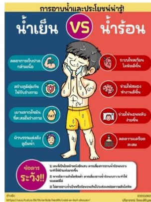
The Benefits of Cold and Hot Showers (Comparison Infographic)