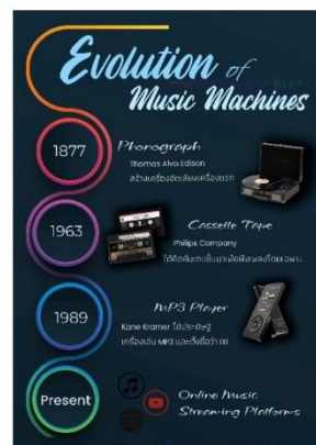
Evolution of Music Machines (Timeline Infographic)