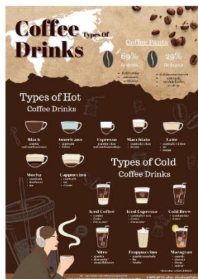
Types of Coffee Drinks (List Infographic)