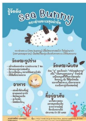
Sea Bunny: Adorable Sea Rabbit (Informational Infographic)