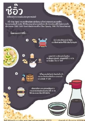
How to Make Soy Sauce (Process Infographic)