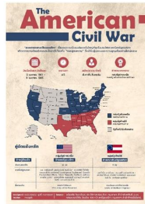
The American Civil War (Informational Infographic)