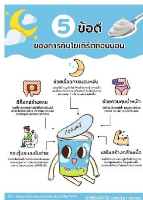
5 Benefits of Eating Yogurt Before Bed (List Infographic)