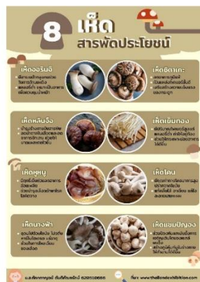
8 Versatile Mushrooms (List Infographic)