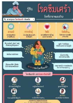
Depression: What You Need to Know (Informational Infographic)